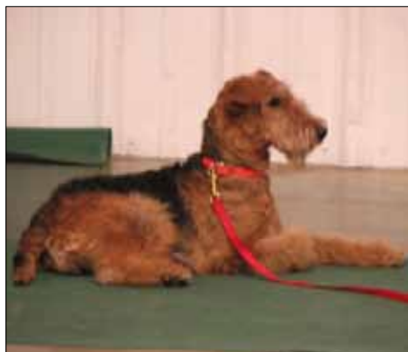
Stone Ridge Pippa's Pretty In Pink, "Annie"