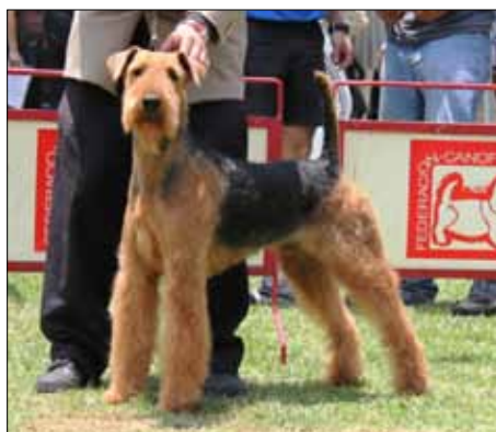
Stone Ridge Sudden Impact, "Callahan"