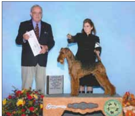
Ch, Huntwood Spyglas of Stone Ridge Tobylinn, "Caelan"